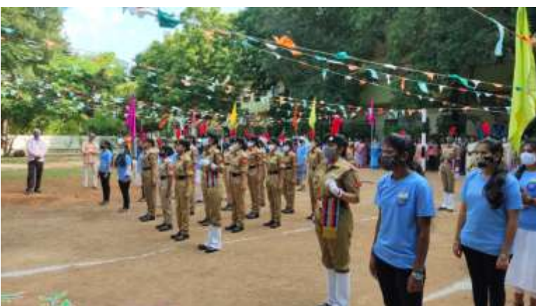
Cross country ICT

Cross country is a part in which teams and individual run a race on often air.