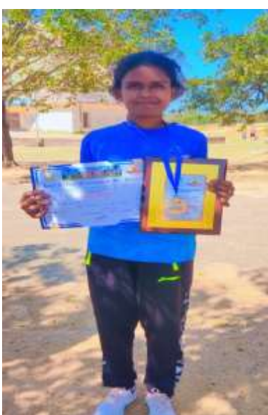
Inter University selection trails