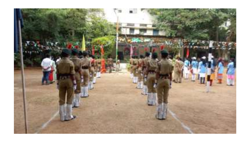
Fit India run

Fit India movement was launched by our prime minister Narendra Modi garu on 29th-aug,2012.the main objective of this program is to make for India .as a part this , our college students along with teacher made a rally .17th-aug,2021.